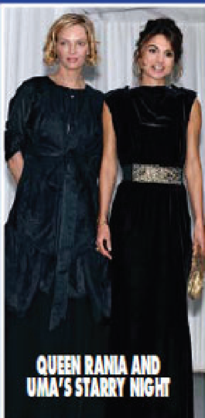
QUEEN RANIA AND UMA'S STARRY NIGHT