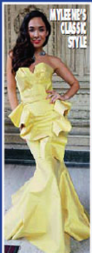
MYLEENE'S CLASSIC STYLE